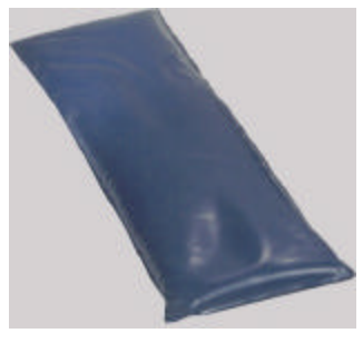
12 Lbs 7 x 24" Cat # 159-12 (no sand # 159-12-0)