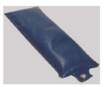
7 Lbs 6 x 17" Cat # 159-7 (no sand # 159-7-0)